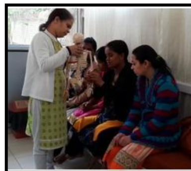
Understanding the body with the help of models

Massages Offered: Swedish, Thai, Deep Tissue, Acupressure and Reflexology.