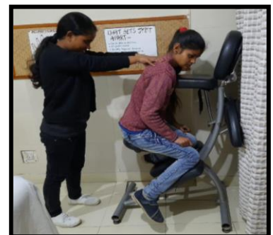
Practicing their skills on each other