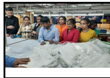
Exposure visit to a garment export unit

The girls, who don't have the aptitude or interest to go for higher studies, are trained with skills of Here the trainees are engaged in making paper products, decorating diyas, , jewellery and other items and garments packaging to gain employment in export houses, or get into income generating work. On the completion of the training, when they are able to contribute towards production, they start getting Stipends too.