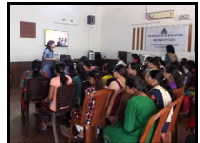
Employer's session with the trainees