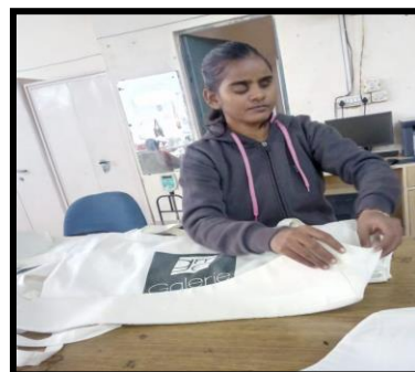
Behtari working in the packing unit at SSMI