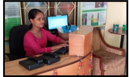
Learning Reception handling

The syllabus for this training has been facilitated by ITC Maurya Sheraton Hotel, New Delhi.