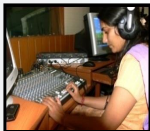
Media Unit/ Studio