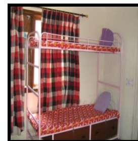
Working Women Hostel