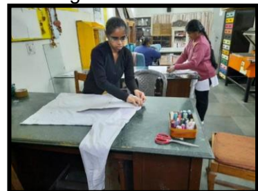
Learning folding of garments