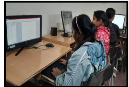
Computer training with speech software

SUCCESS / EDUCATION & EMPLOYMENTS/ CAPACITY BUILDING: