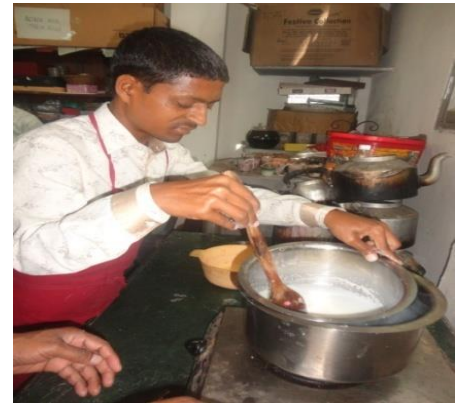
Figure 2: Pouring liquid soap into moulds

The trainees were also taken on exposure trips to the nearby markets to explore the kinds of soaps available and their pricing. On the last day of the workshop they were taken to a wholesalers' market to be able to know about how and where to buy their raw material on cheapest possible rates.