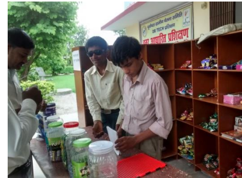
Figure 4: Shop keeping

Visits were also made to schools for children with hearing impairment and another one for children with visual impairment. Another Centre visited was one where children with moderate to severe orthopaedic impairments were being treated with the help of alternative