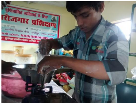
Figure 6: Detergent making

fine, sweet box making had some parts to be made blind friendly. A gauge has been designed to solve the problem and make the training and the trade feasible for them.