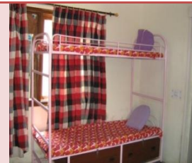
Working Women Hostel