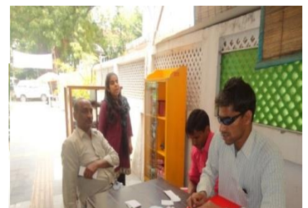
Figure 1: Shop keeping training

Besides theory and practical sessions on the detergent making, it also comprised of training in the kitchen- identification of the spices and lentils, boiling water and making tea; shop keeping and café managing, currency handling, mobility. Discussions were also done on entrepreneurship, cost and price of goods, door to door selling, and special sessions were held by Khadi Village & Industries Commission (KVIC), NHFDC and YES Bank.