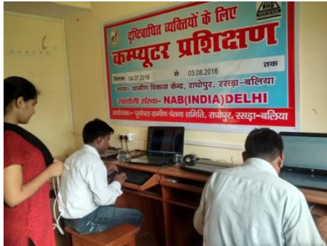
Figure 3 Computer Training at Balia, UP

fine, sweet box making had some parts to be made blind friendly. A gauge has been designed to solve the problem and make the training and the trade feasible for them.