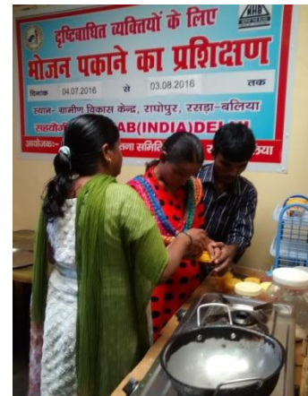
Figure 5: Learning to cook