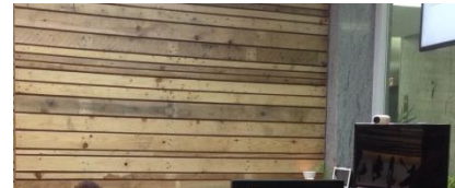
Ritu at Expedia on the reception