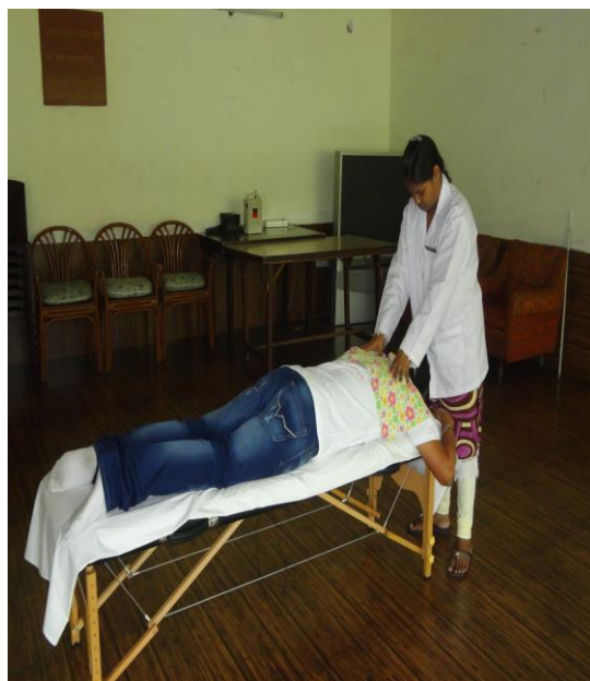
Taj Hotel training blind girls on `Sandwiches Blind therapist giving therapy to public for curing life style related conditions