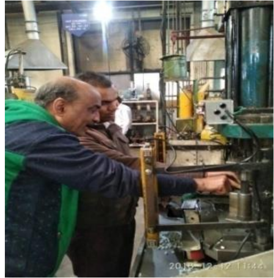
Blind Youth at packaging training in a factory