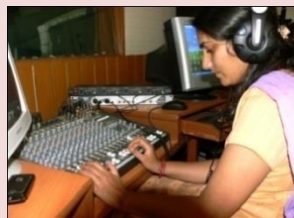
Media Unit/ Studio