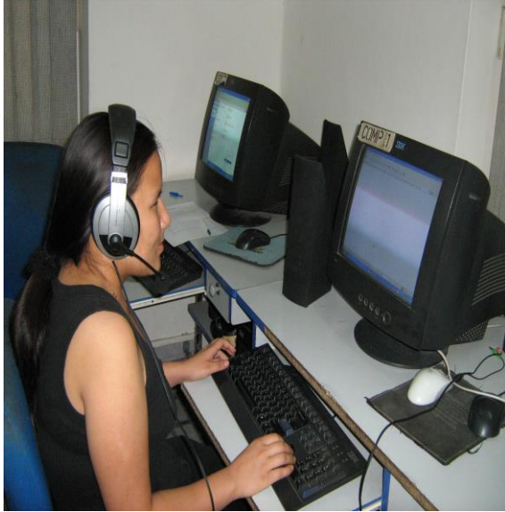
Blind girl at Computer Training