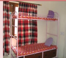
Working Women Hostel