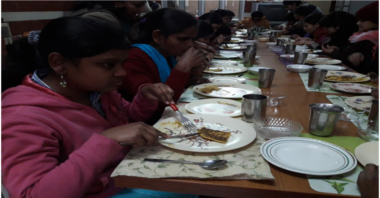
Table manners & cutlery usage